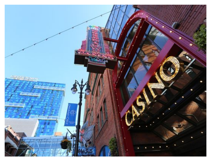
Greektown Casino-Hotel in Detroit saw revenue rise 1% in 2015

The three casinos reported submitting $174.3 million in taxes for 2015 to the city, or $5.2 million more than Detroit had budgeted for its fiscal year that ends June 30, 2016.